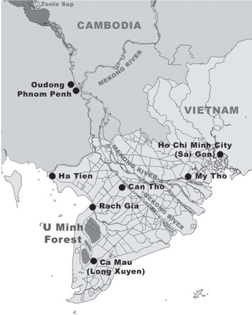
Map 1. U Minh Forest.