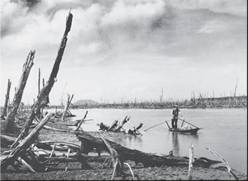
Figure 2. Lower U Minh Forest after Defoliation.